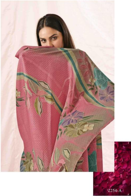
A stunning pattern of intricate masterpiece inspired by beauty from Indian culture