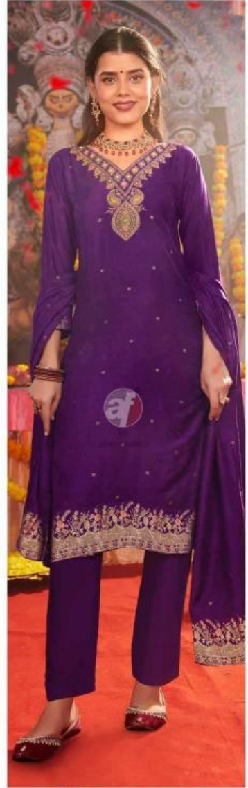
PALKI Vol-04 4046