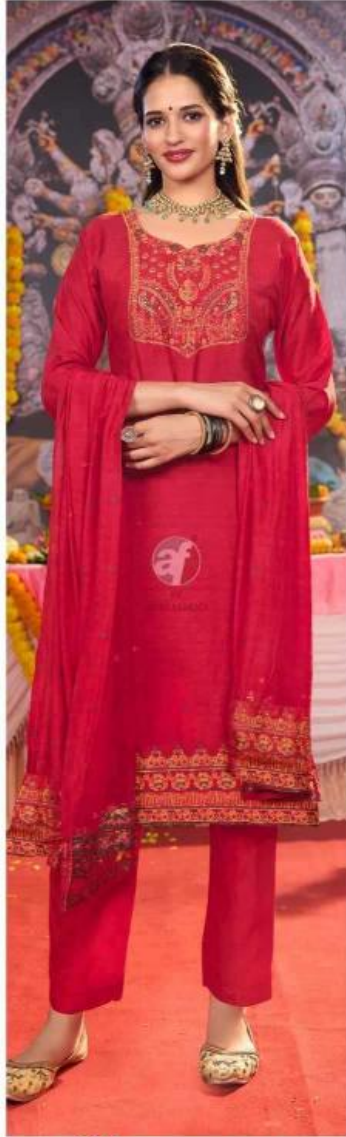
PALKI Vol-04 4045