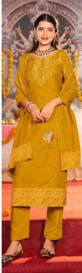
PALKI Vol-04 4042