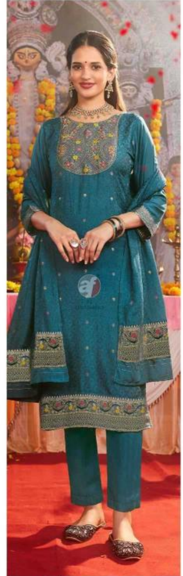
PALKI Vol-04 4043