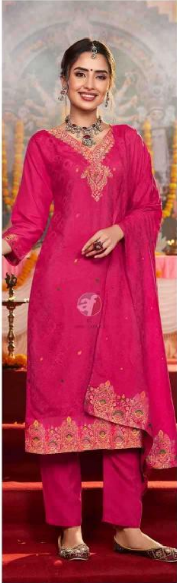
PALKI Vol-04 4041