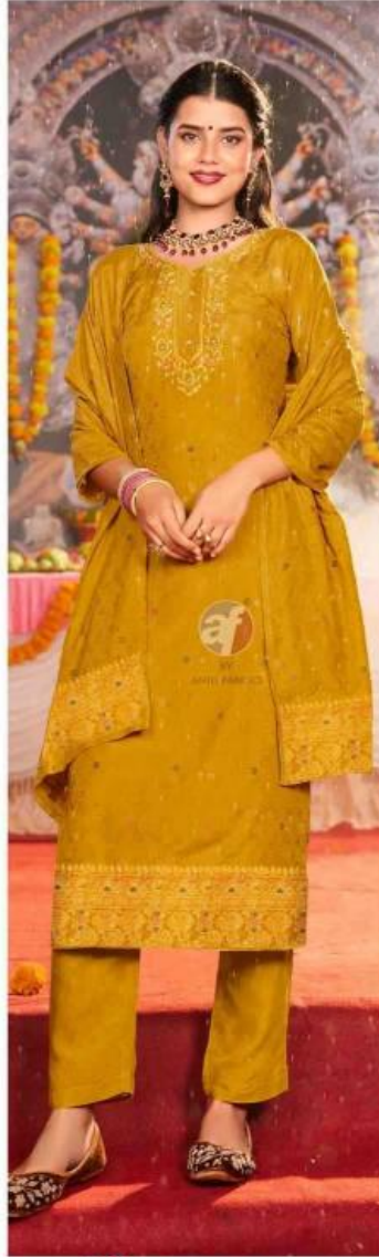
PALKI Vol-04 4042