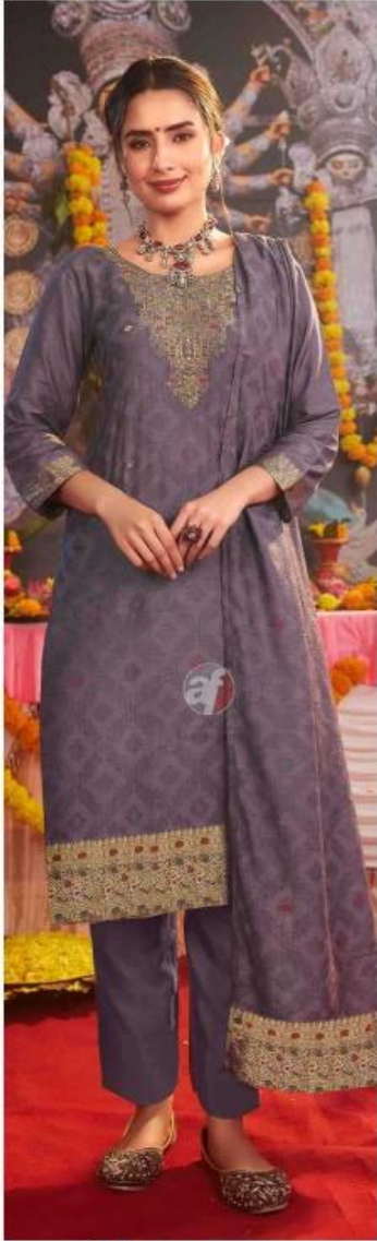
PALKI Vol-04 4044