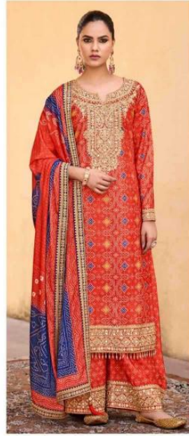
SHRINGAR | 3023