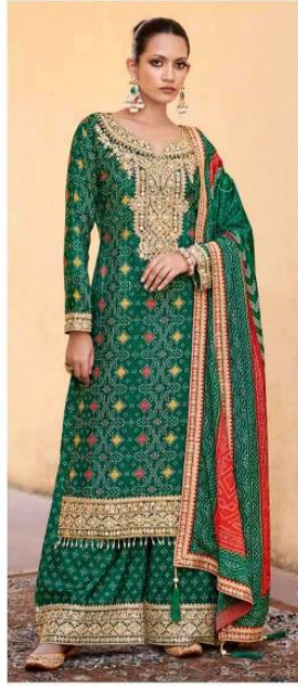
SHRINGAR | 3022