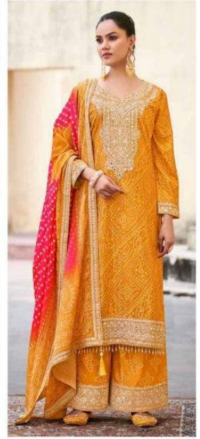
SHRINGAR | 3024