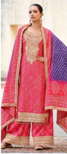
SHRINGAR | 3021