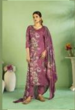
Gulnaaz 2037 D