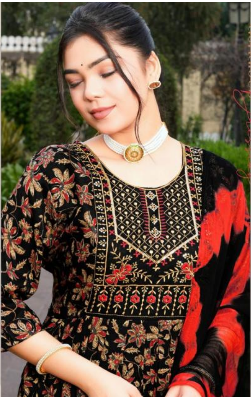
One is never over-dressed or under-dressed with a Little Orange Dress.