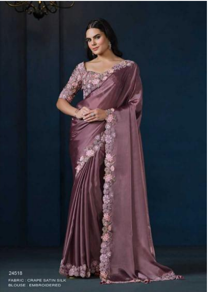
24518 FABRIC : CRAPE SATIN SILK BLOUSE : EMBROIDERED