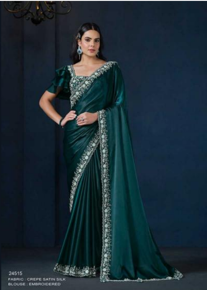
24515 FABRIC : CREPE SATIN SILK BLOUSE : EMBROIDERED