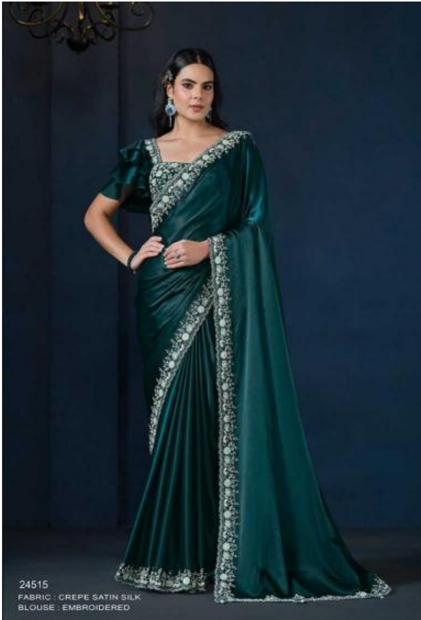
24515 FABRIC : CREPE SATIN SILK BLOUSE : EMBROIDERED