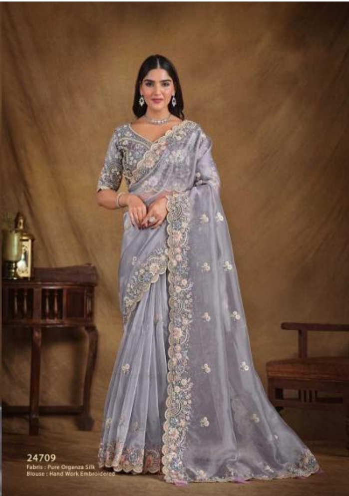
24709 Fabric : Pure Organza Silk Blouse : Hand Work Embroidered