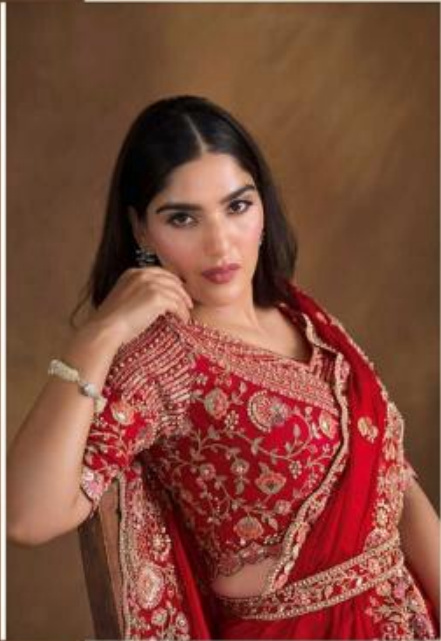
24710 Fabric : Two tone Satin Silk Blouse : Hand Work Embroidered