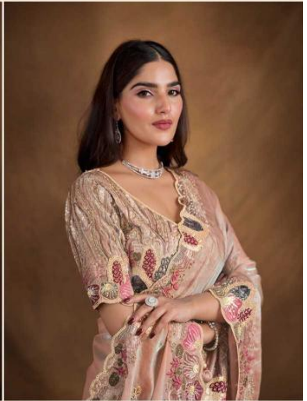
◆◆◆ 24712 Fabric: Two tone Satin Silk Blouse : Hand Work Embroidered