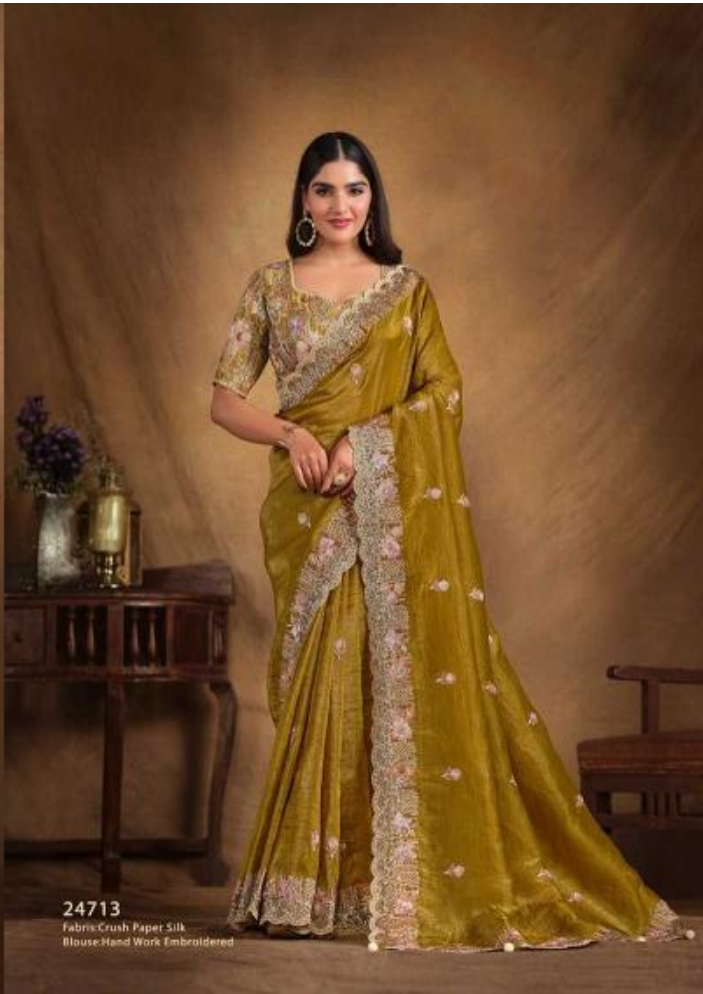
24713 Fabric:Crush Paper Silk Blouse:Hand Work Embroidered