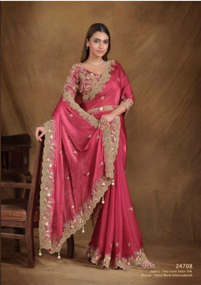
24708 Fabrics : Two tone Satin Silk Blouse : Hand Work Embroidered