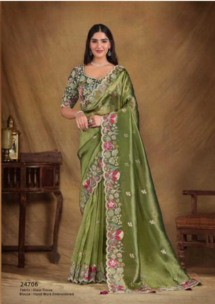
24706 Fabric : Glass Tissue Blouse : Hand Work Embroidered