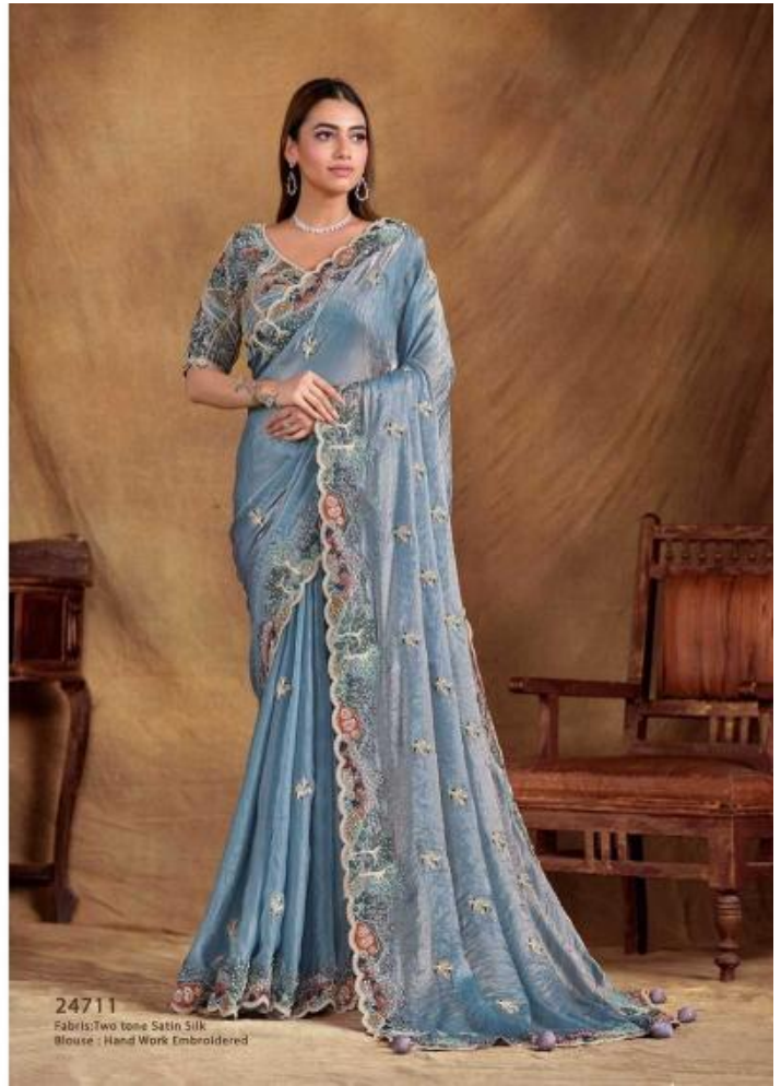
24711 Fabric: Two tone Satin Silk Blouse : Hand Work Embroidered