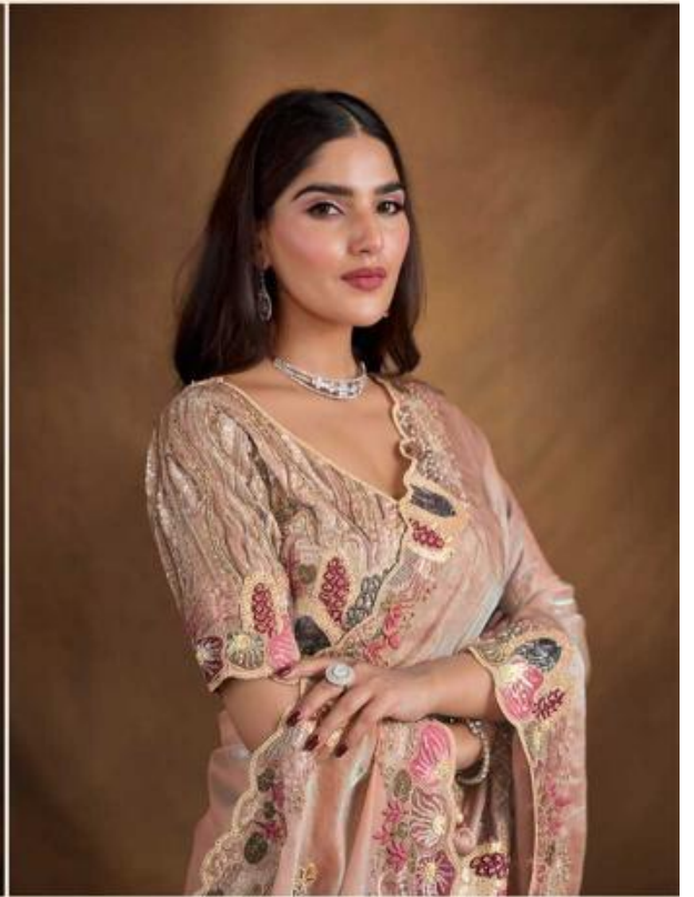
◆◆◆ 24712 Fabric: Two tone Satin Silk Blouse : Hand Work Embroidered