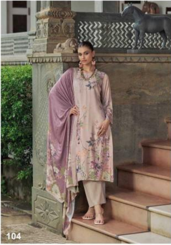
What you wear is how you present yourself to the world, especially today, when human contacts are so quick. Fashion is instant language