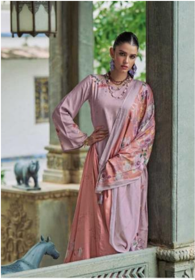
Style is something each of us already has, all we need to do is find it.