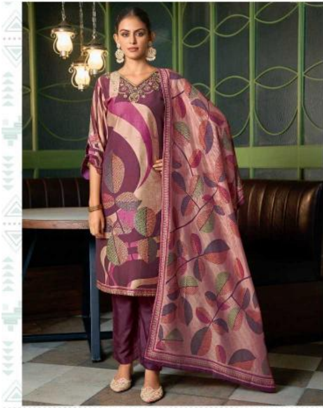
Indian Fashion Saree Kurta and Pants are all the way wonderful and elegant and very to wear. Designer Saree, Saree Kurta and Pant are the best trend in Indian Fashion. They are available in different colors and designs. They are made in India and are very to wear. They are available in different colors and designs. They are made in India and are very to wear.