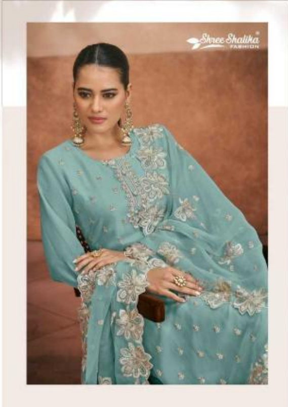
The SHAKH, THE BEAUTY of women will work their magic, as they bring to you your ideal look.