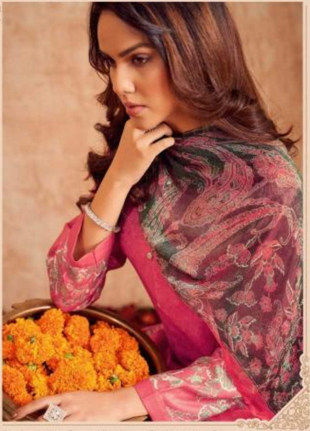
Wrap Yourself in the Blessings of Time-Honored Fabrics with Kurris that Reflect the Grace of Our Ancestry, Beautifully Tailored for the Woman's Wardrobe. NIRAN | 005