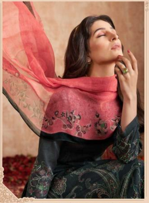
Let the rich hue of Sea-green elevate your style & make you stand out. Threads of Tradition. Woven with Style!