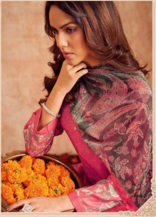
Wrap Yourself in the Veil of Time-Honored Fabrics with Kurris that Reflect the Grace of Our Ancestry, Beautifully Tailored for the Woman's Wardrobe. NIRAN | 005