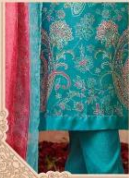
Embrace the Spirit of Heritage with Every Wear, as Our Ethnic Kuris Bring Together the Essence of Cultural Pride and the Charm of Modern Style.