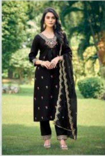
▪ | 2001 | ▪