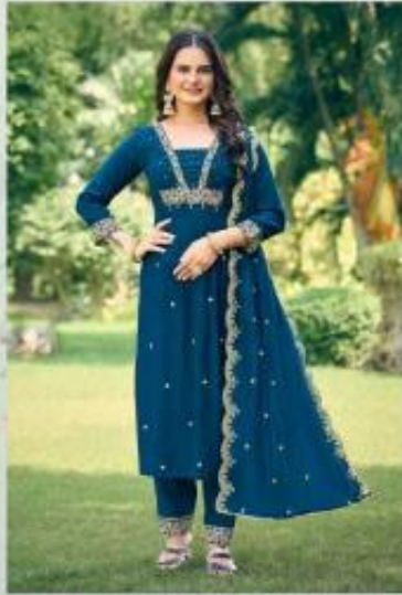
▪ | 2003 | ▪