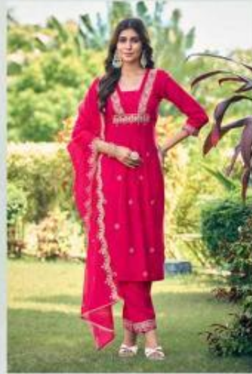
▪ | 2004 | ▪