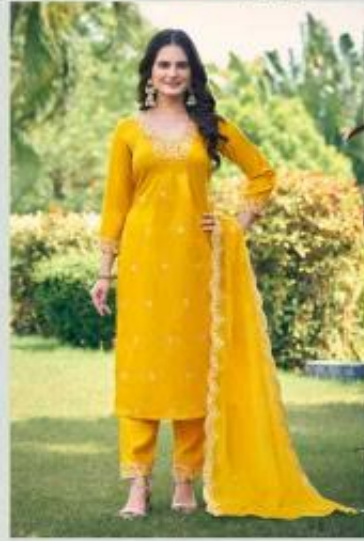
▪ | 2002 | ▪