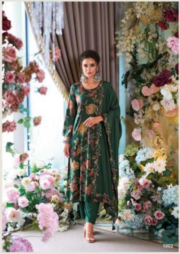
Even in the darkest corners, there is always a glimmer of light!