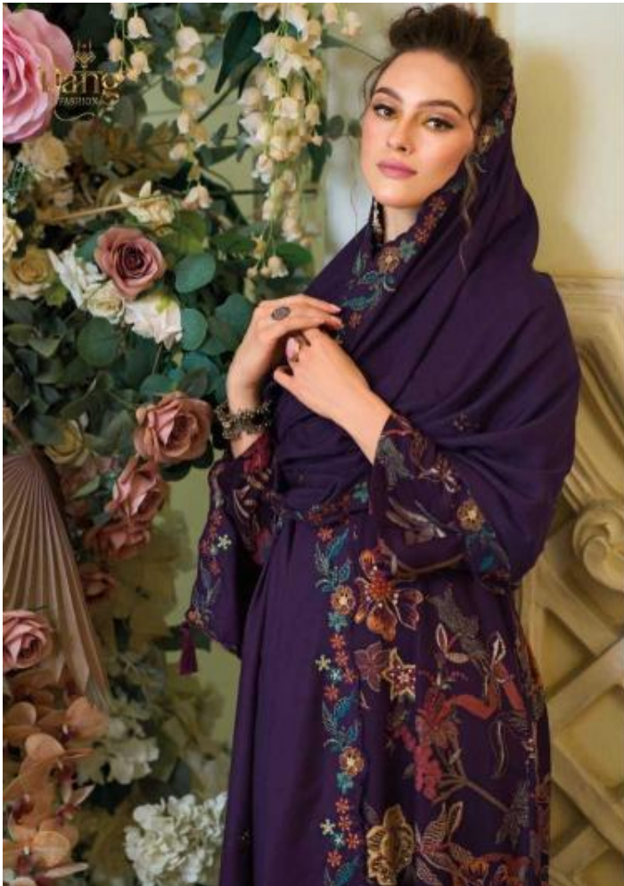
The shawl had been too rough and carried too many stories to be just a piece of fabric.