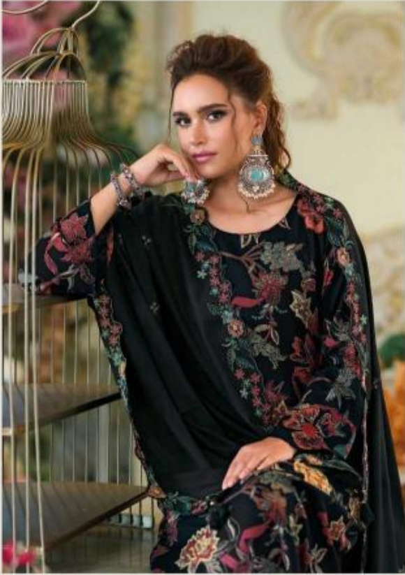
The threads of destiny are woven with unforeseen connections