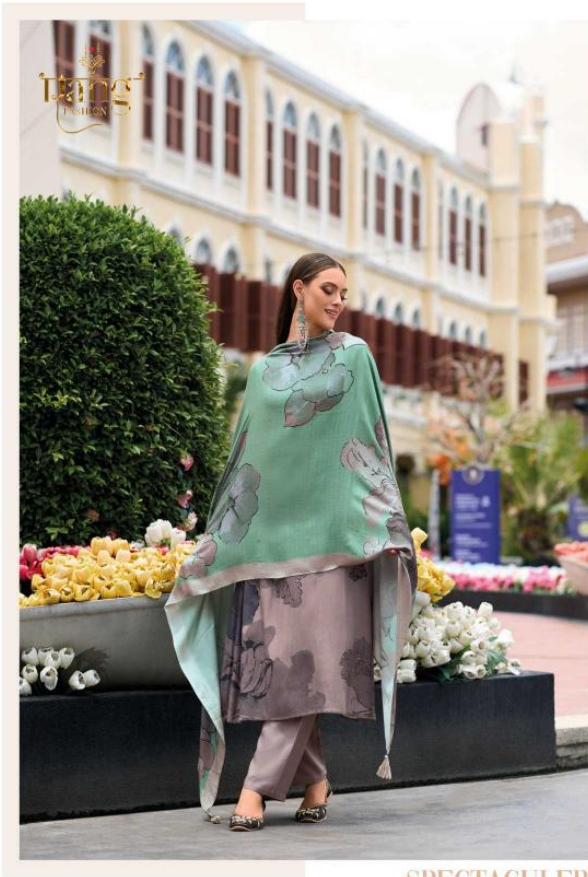
SPECTACULER She is a Queen, her soul is royalty