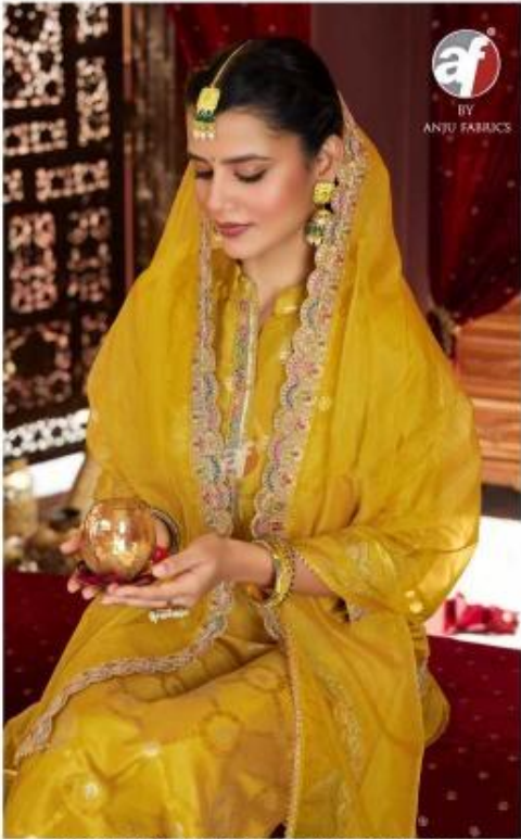
Trying to match my outfit's sparkie with my festive spirit.