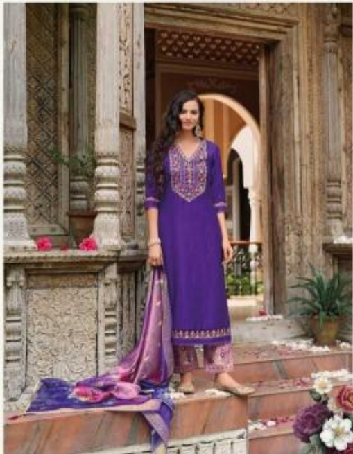
REALITY OF EVERYDAY