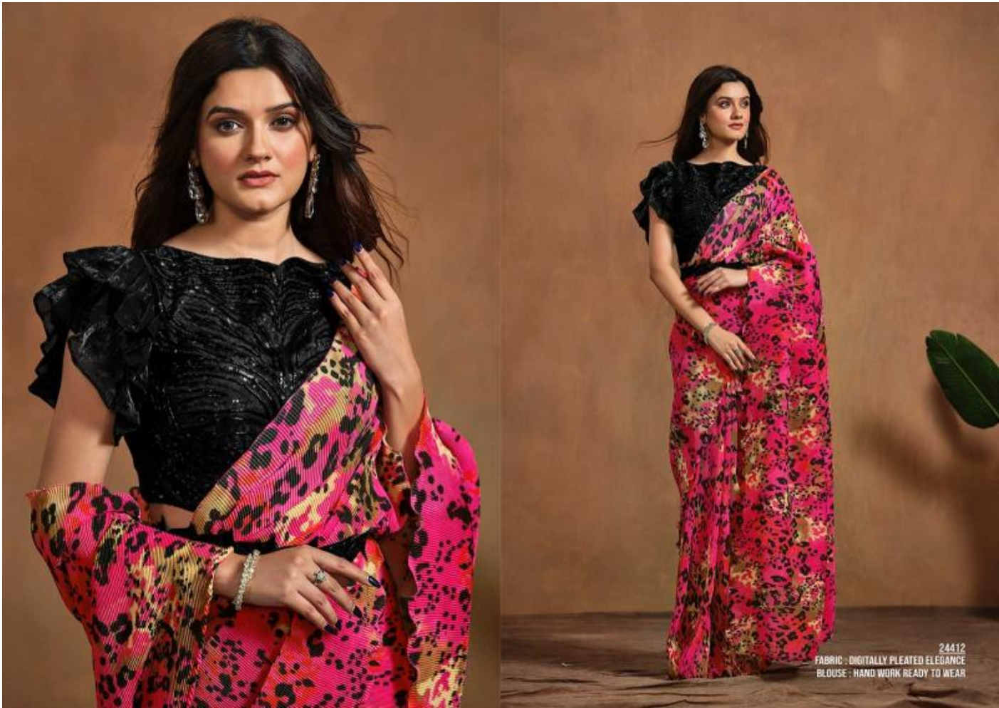
24412 FABRIC : DIGITALLY PLEATED ELEGANCE BLOUSE : HAND WORK READY TO WEAR