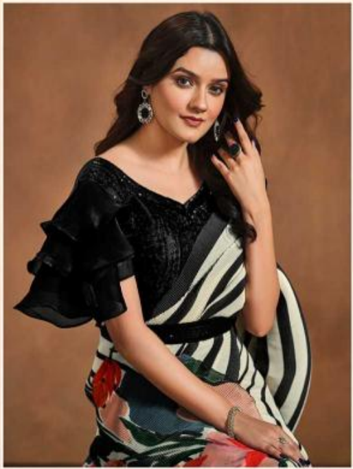
24410 FABRIC : DIGITALLY PLEATED ELEGANCE BLOUSE : HAND WORK READY TO WEAR

Keeping up with the Adah latest trends, where designs that are both elegant and chic.