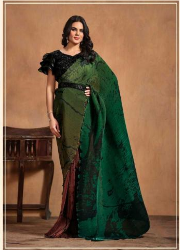
24409 FABRIC : DIGITALLY PLEATED ELEGANCE BLOUSE : HAND WORK READY TO WEAR