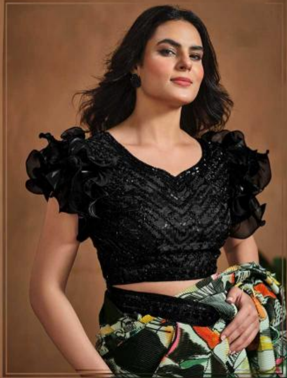
24415 FABRIC: DIGITALLY PLEATED ELEGANCE BLOUSE: HAND WORK READY TO WEAR

Our product names are designed for ease and clarity, allowing you to look through with absolute ease.