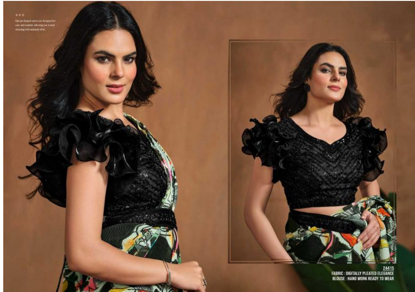
24415 FABRIC : DIGITALLY PLEATED ELEGANCE BLOUSE : HAND WORK READY TO WEAR

Our products are designed for use and market. All designs to look strong with absolute class.