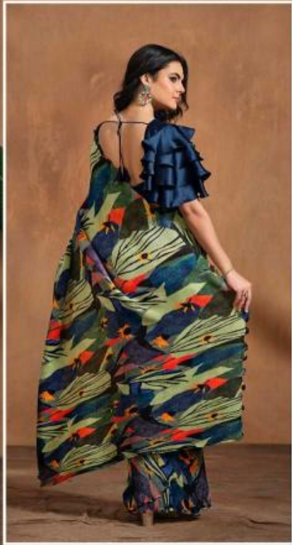
24413 FABRIC : DIGITALLY PLEATED ELEGANCE BLOUSE : HAND WORK READY TO WEAR