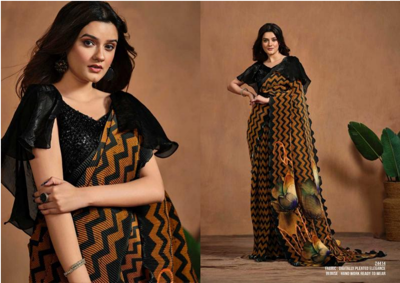
24414 FABRIC : DIGITALLY PLEATED ELEGANCE BLOUSE : HAND WORK READY TO WEAR