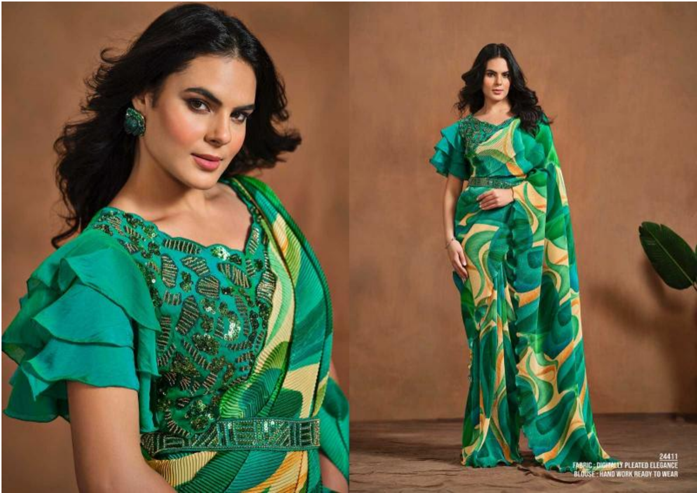
24411 FABRIC - DIGITALLY PLEATED ELEGANCE BLOUSE - HAND WORK READY TO WEAR