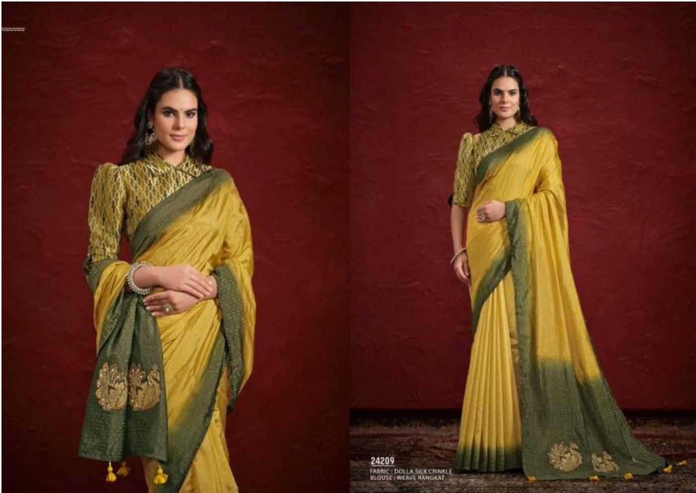
24209 FABRIC : DOLLA SILK CRINKLE BLOUSE : WEAVE HANGKAT