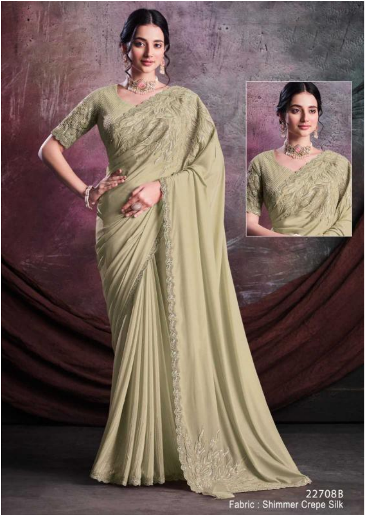
22708B Fabric : Shimmer Crepe Silk