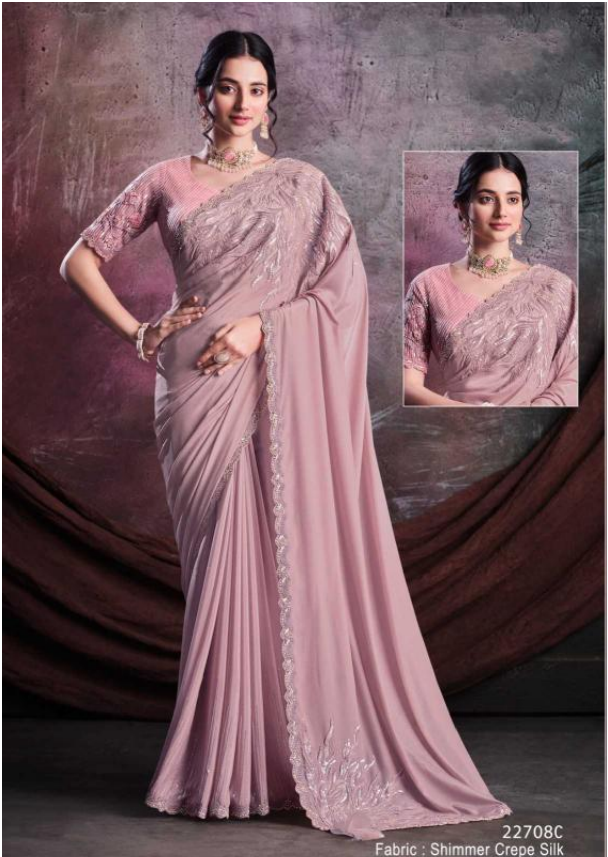
22708C Fabric : Shimmer Crepe Silk