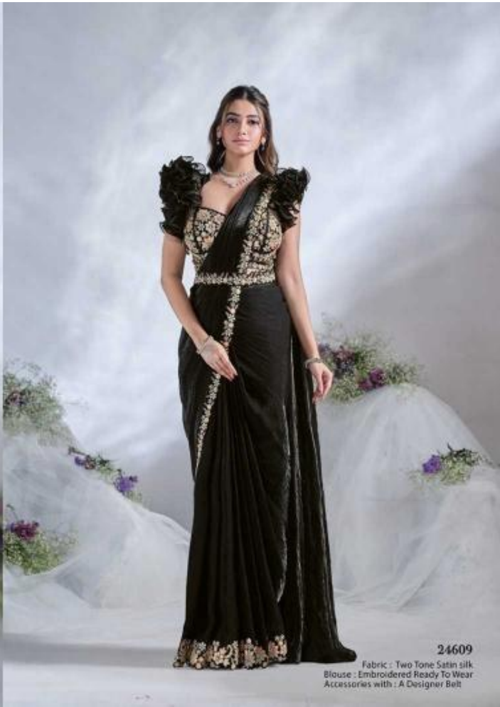
24609 Fabric : Two Tone Satin silk Blouse : Embroidered Ready To Wear Accessories with : A Designer Belt