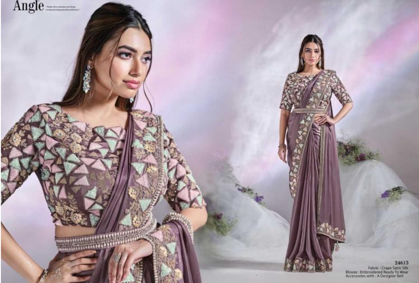
24613 Fabric : Crepe Satin Silk Blouse : Embroidered Ready To Wear Accessories with : A Designer Belt

all about YOU..... Angle "Quality often is defined not of being "having" but of being "used" and "loved".