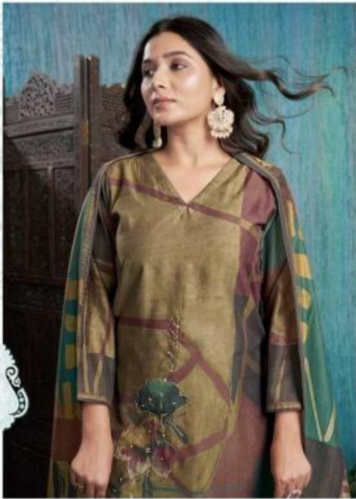
Shawl Karna and long dress in any weather suitable. The Karna is the ideal pair around your Embroidered Karna. It is your Karna, Printed Karna, Cotton Karna, Lawn Karna, Linen Karna, Long Karna, Shawl Karna, Embroidered Karna, Cotton Karna and Printed Karna are the various Karna. It has a variety of its own style and design look in a more sophisticated.