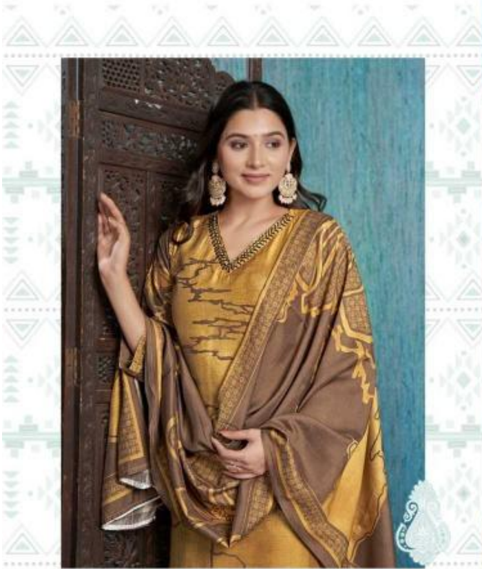
Indian Fashion Designer Sarees and Kurta are all the way available in elegant and classic in color. Designer Sarees, Saree, Kurta and Shawl are the latest trend in Indian Fashion. Some are printed in digital and some are hand printed. They are made in silk, cotton, polyester, rayon, etc. for special occasions, parties, or events for a wedding ceremony.