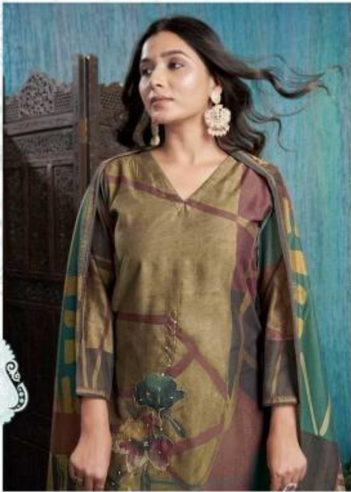
Shawl Kari's soft feel gives it an exclusive identity. The Kari is the ideal pair around your Embroidered Kari. It's your Kari, Printed Kari, Cotton Kari, Lawn Kari, Linen Kari, Long Kari, Short Kari, Embroidered Kari, Cotton Kari and Printed Kari are the various shades. Kari is a beautiful and classic look in a subtle fashion.