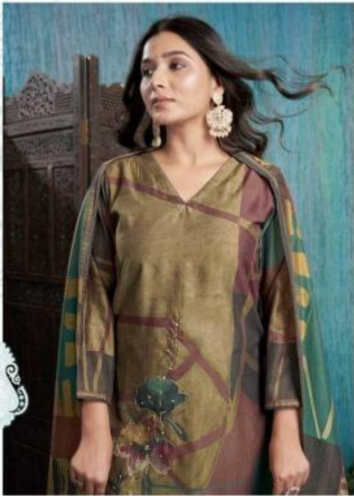
Shawl Kari's soft feel gives it an exclusive identity. The Kari is the ideal pair around your Embroidered Kari. It goes Kari, Printed Kari, Cotton Kari, Lawn Kari, Linen Kari, Long Kari, Shalwar Kari, Embroidered Kari, Cotton Kari and Printed Kari are the various shades. Kari is best worn in a simple and elegant look in a simple and elegant look.