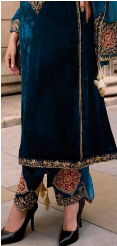
IBIZA D.no: 18005