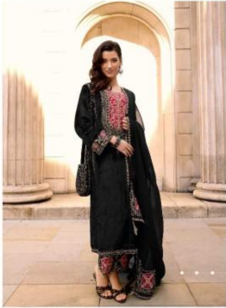
Designer: IBIZA is a collection of elegant and sophisticated dresses for the wedding season. The fabric is a blend of silk and satin, which gives it a soft and smooth texture. It is a long-sleeved dress with a high collar and a matching shawl. The embroidery is done in red and gold, which adds a touch of elegance to the dress. The length of the dress is just above the ankles, which makes it perfect for a wedding ceremony.