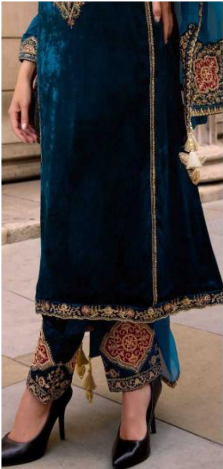
There's something elegant about the way a woman wears her style. D.no-18005