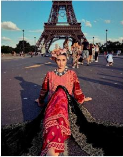
The style is not too big, a wide chest, tight pants, and I wear diamonds.