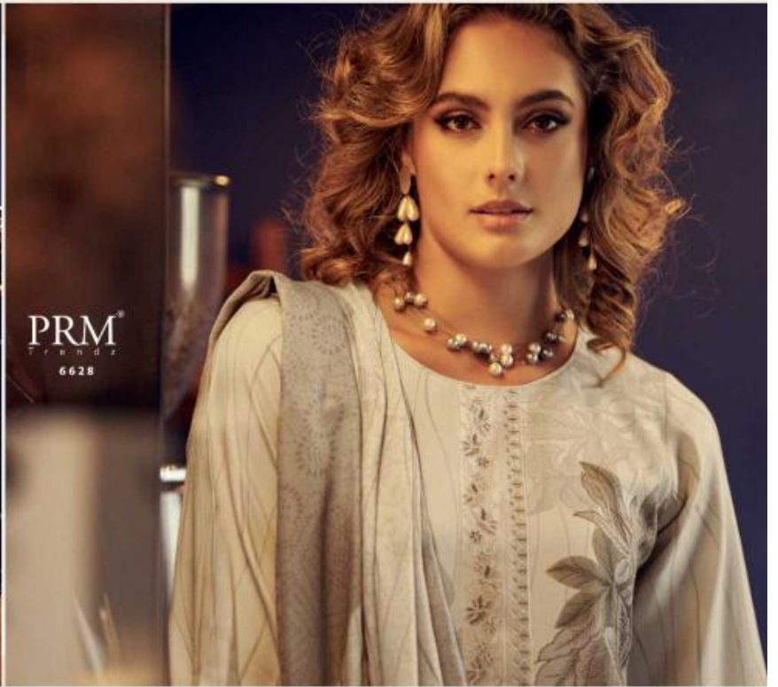
The timeless trend of sarees.