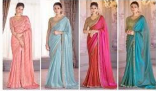
2113-#### 2114-#### 2115-#### 2116-####