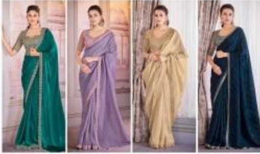
2101-#### 2102-#### 2103-#### 2104-####