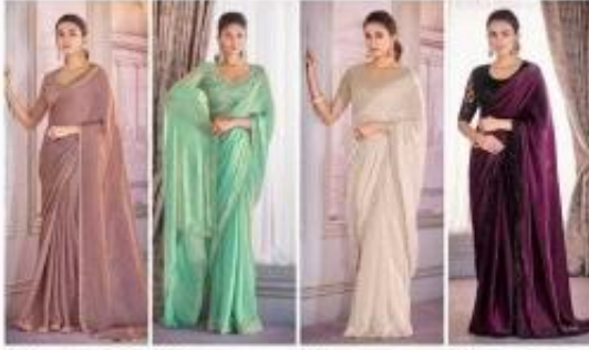
2105-#### 2106-#### 2107-#### 2108-####