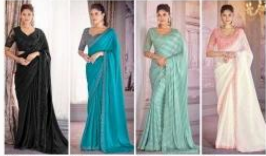
2109-#### 2110-#### 2111-#### 2112-####