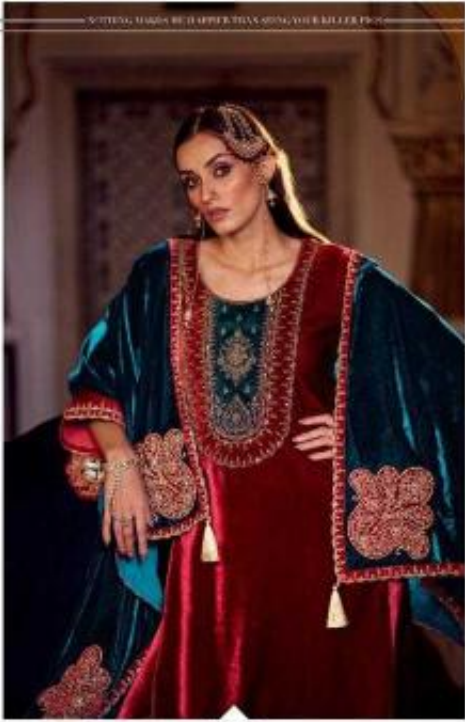
V-2003 — 000 —