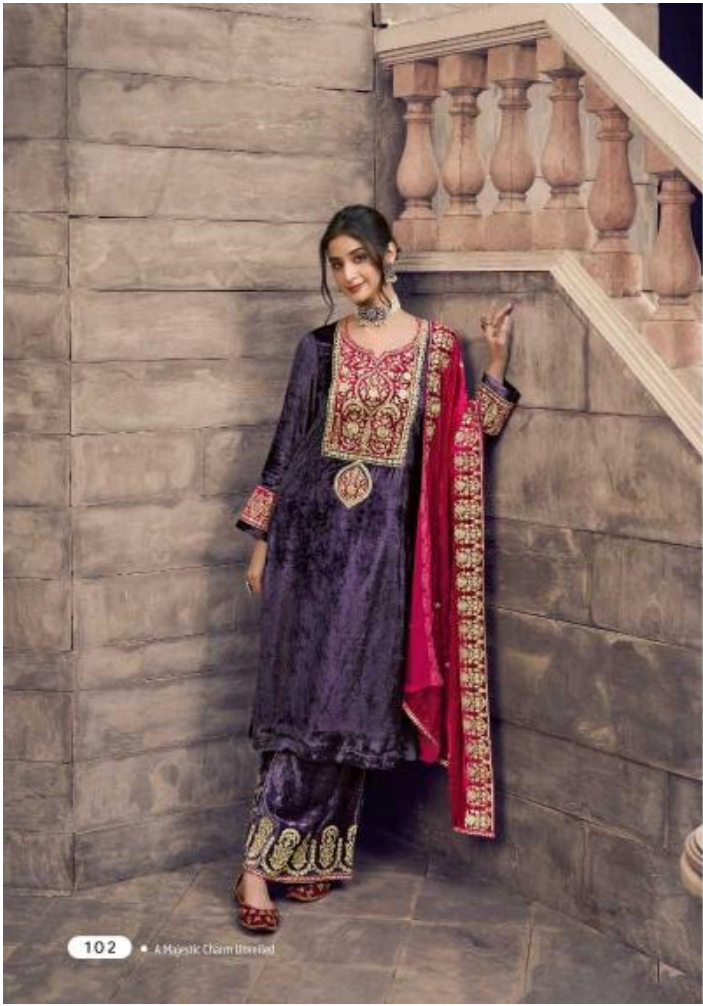
102 • A Majestic Charm Unveiled