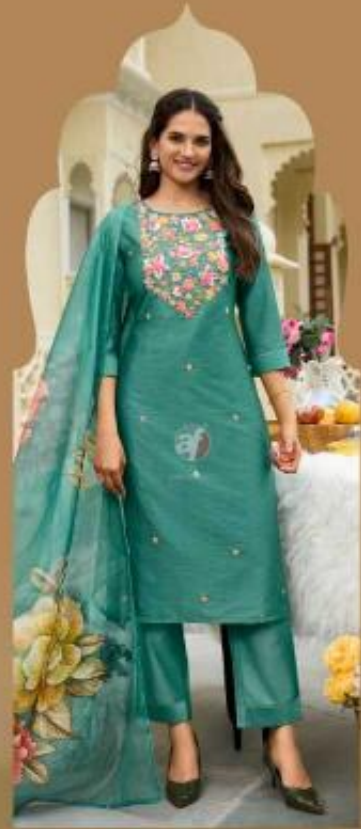
DESI DHAGA 3886