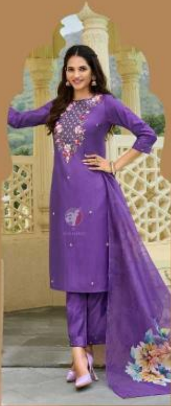
DESI DHAGA 3884