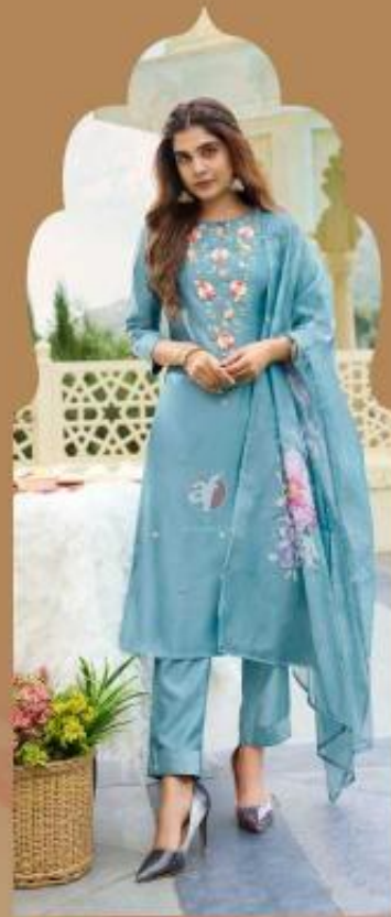
DESI DI LAGA 3883