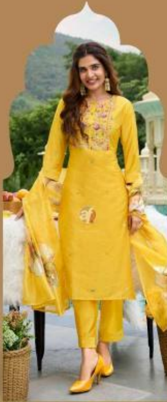
DESI DHAGA 3885