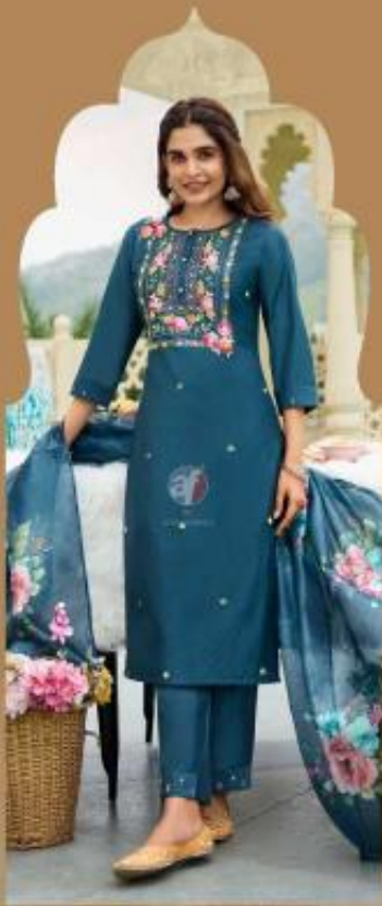
DESI DI LAGA 3881