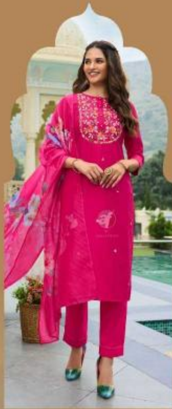
DESI DI LAGA 3882