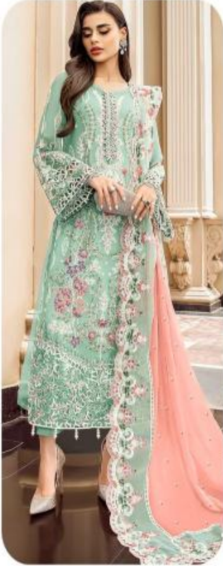
D.No | 277-A

TOP - Orgenza With Heavy Embroidery DUPATTA - Orgenza With Heavy Embroidery INNER - Santoon BOTTOM - Santoon