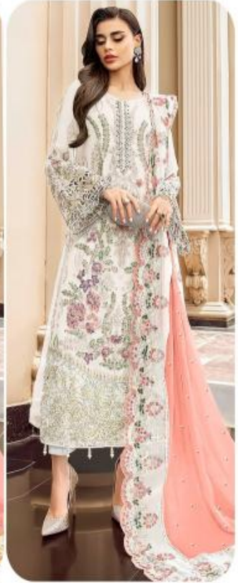
D.No | 277-D