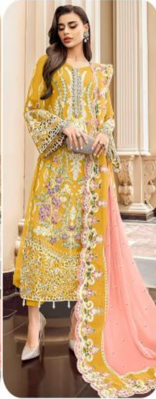
D.No | 277-C