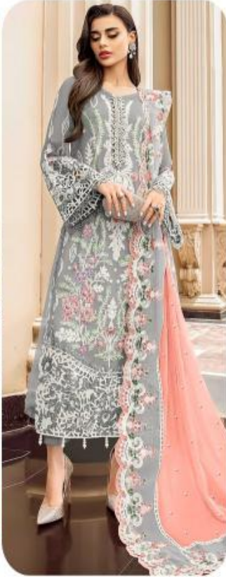
D.No | 277-B