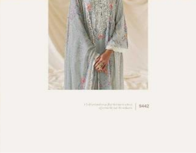
1 | 100% Cotton and silk | 200cm length | 100cm chest | 100cm waist | 100cm hips | 9442