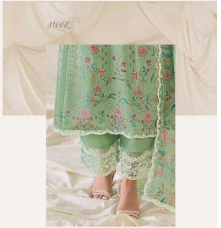
9448 | Light green color of the dress and dupatta with intricate floral embroidery and lace trim. Available in sizes 36 to 42.