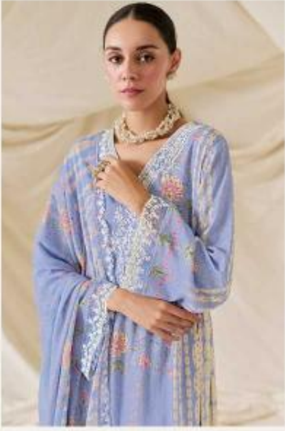
9444 | A piece of blue in the language of silence and craft, quiet like