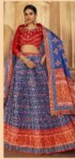
*** 2103 ***