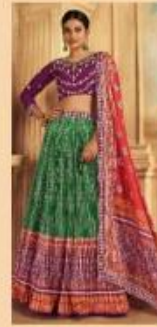
*** 2107 ***