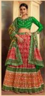
*** 2102 ***