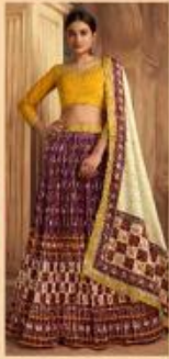
*** 2105 ***