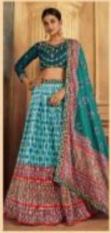
*** 2104 ***