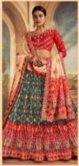
*** 2101 ***