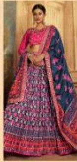
*** 2106 ***