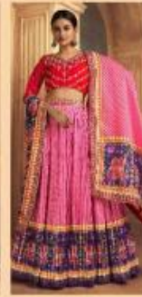
*** 2109 ***