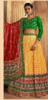
*** 2108 ***