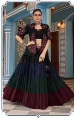
RASS - 2443