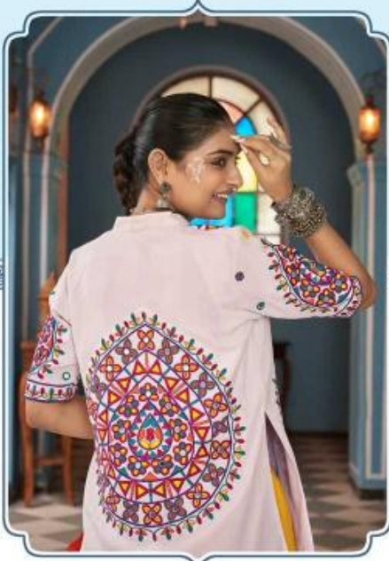
RASS - 2441