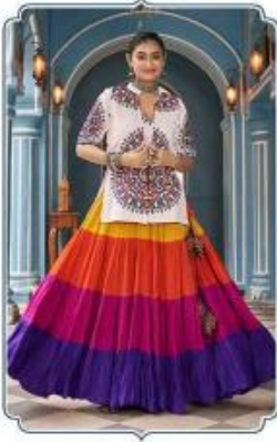
RASS - 2441