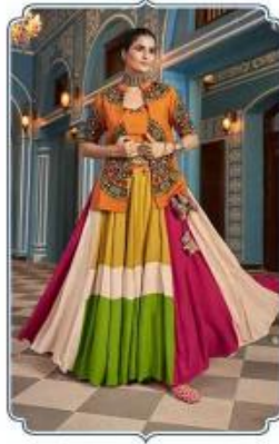
RASS - 2444