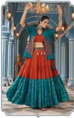
RASS - 2442