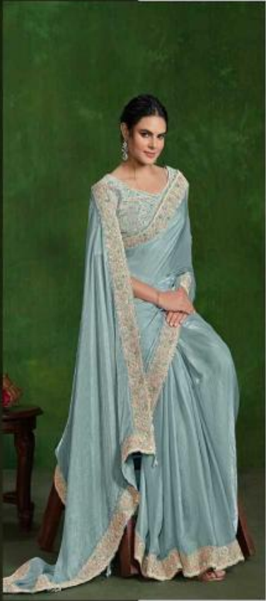
24304 FABRIC : TWO-TONE SHIMMER SATIN BLOUSE : EMBROIDERED READY TO WEAR