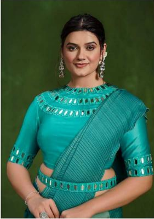
The alluring effect of a masterpiece with intricate beauty makes it an exquisite piece of fashion craft