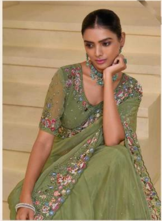
In a saree, you're always dressed for success