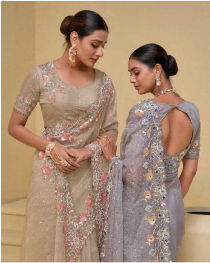
Designed in a saree, I don't like the freedom of my saree. It's a saree.