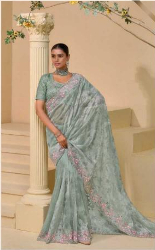
Life may not be perfect, but your saree can be.