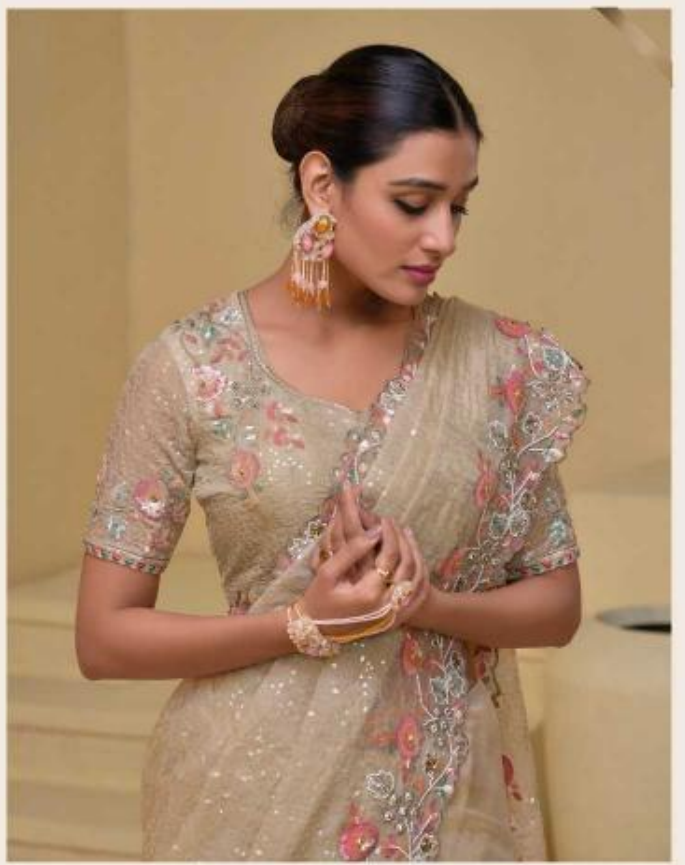
Designed in a saree, I feel like the heroine of my own life's movie.