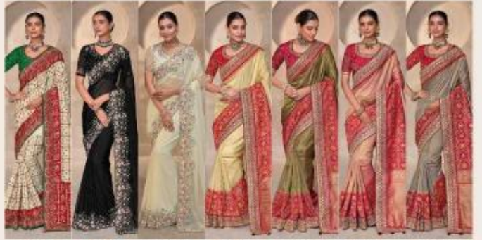
7302 7502 BLACK 7507 WHITE 11004 - A 11004 - B 11004 - C 11004 - D