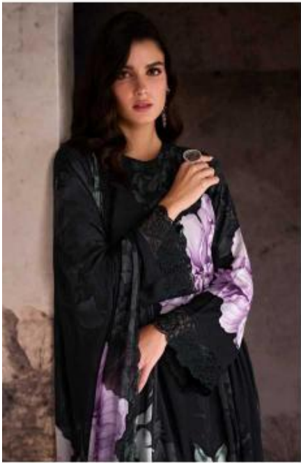
MODERN SOPHISTICATION A contemporary take on the classic black and purple floral pattern, featuring a modern silhouette and a sophisticated color palette. 9424