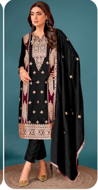
D.No | 294-D