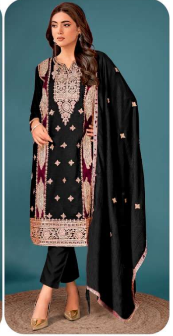
D.No | 294-D