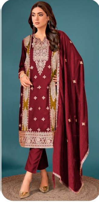
D.No | 294-B