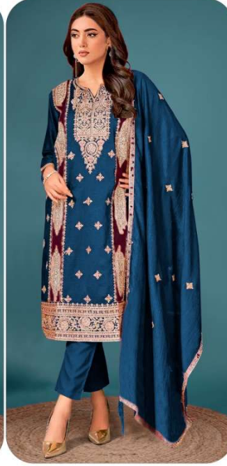
D.No | 294-C