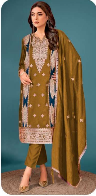
D.No | 294 A