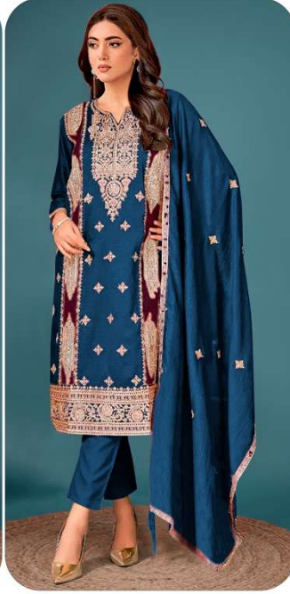
D.No | 294-C