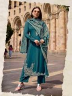
D | 1005