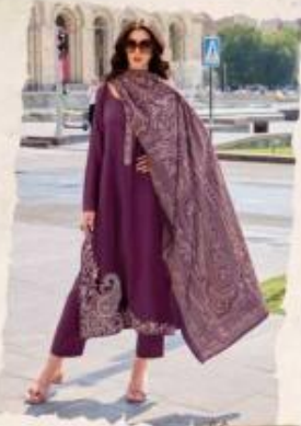
D | 1001