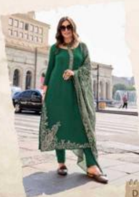
D | 1003