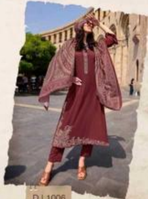
D | 1006