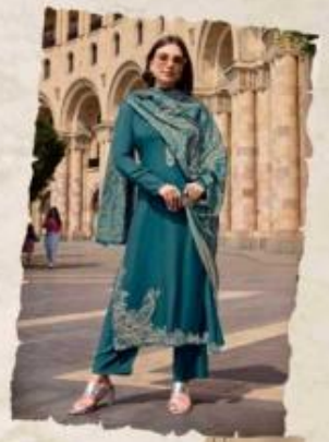
D | 1005