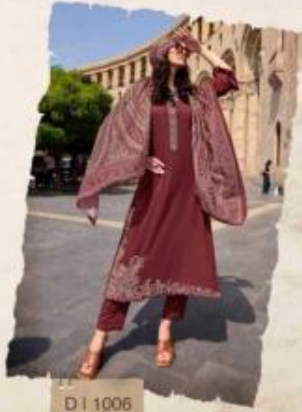
D | 1006