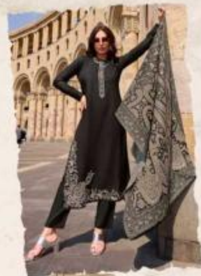
D | 1004