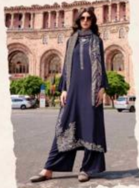
D | 1002