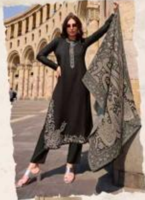
D | 1004