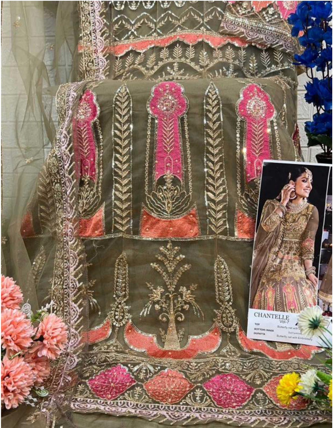
CHANTELLE Vol-7 TOP Subdy net with BOTTOM INNER Dull Satin DUPATTA Subdy net with Embroidery