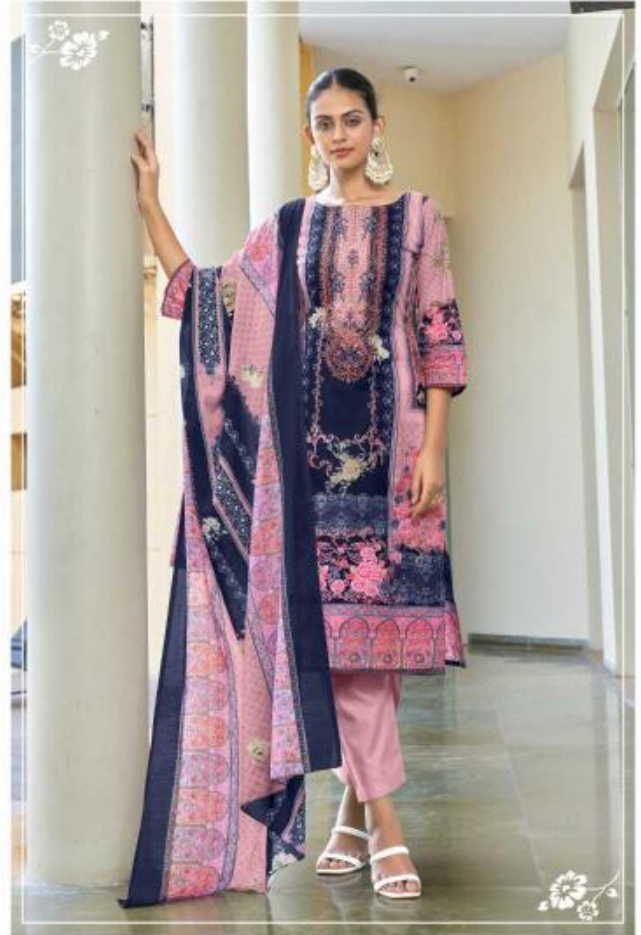
D.NO. 1001 C