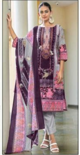
D.NO. 1001 D