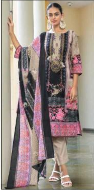
D.NO. 1001 A