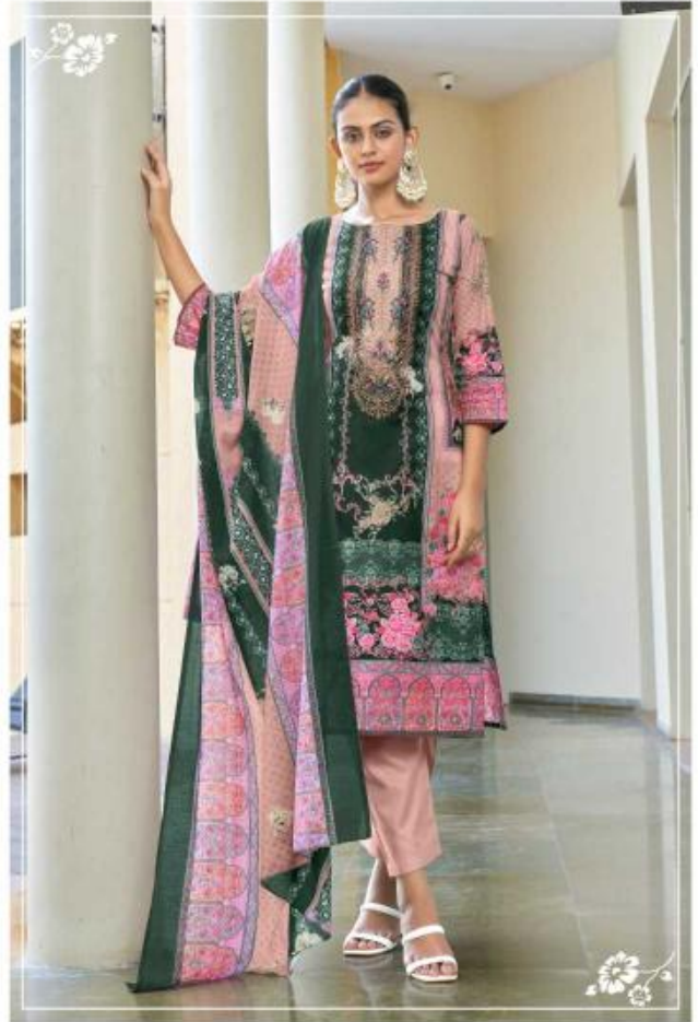
D.NO. 1001 B