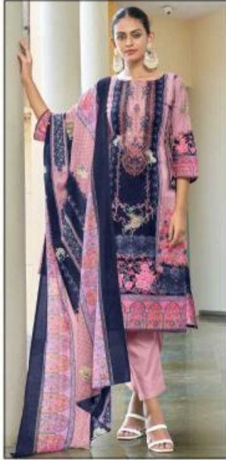
D.NO. 1001 C