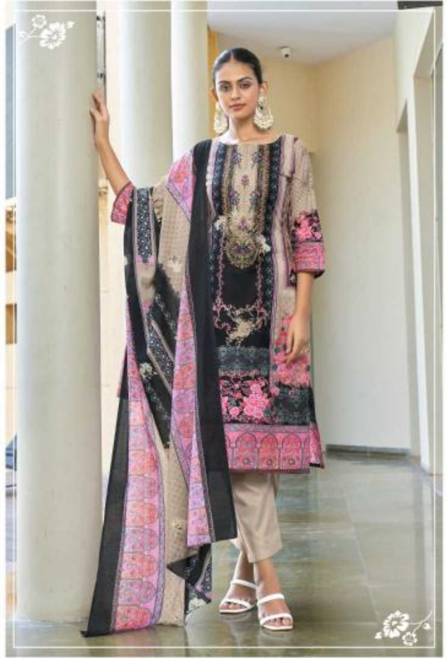
D.NO. 1001 A