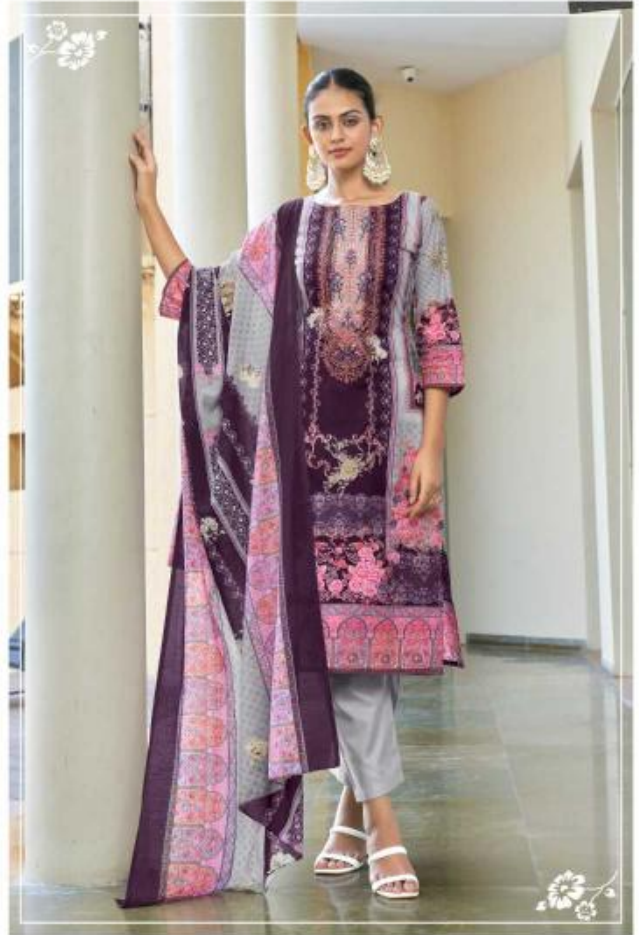
D.NO. 1001 D