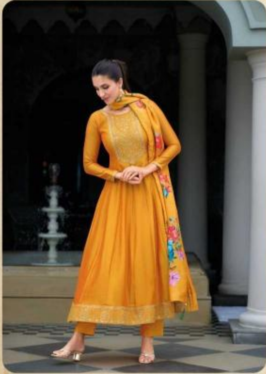
Yellow 121 with blue & green. Size 36-40. Price 12,999.00