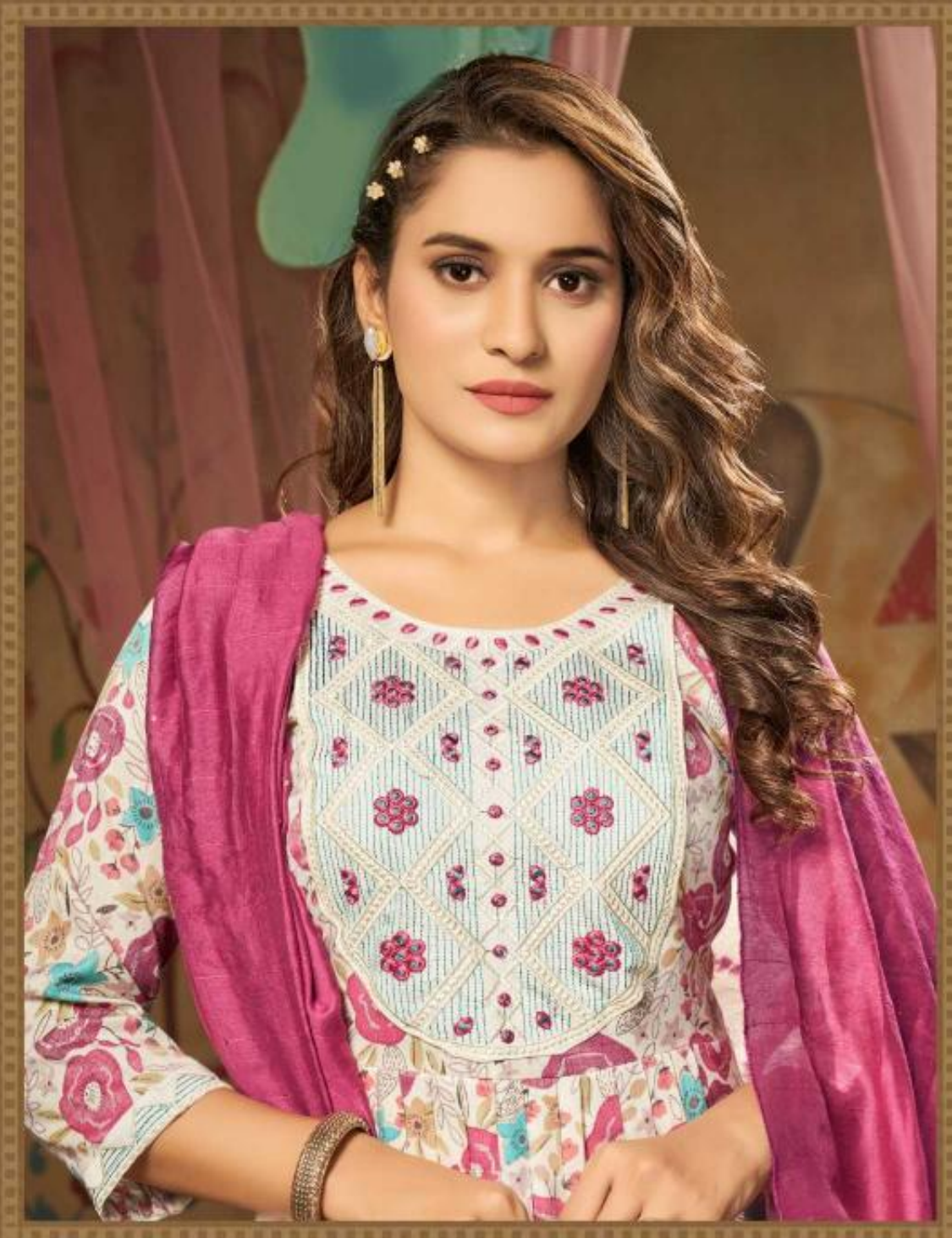
each dress give different look to electric power design we list the top trends for the season