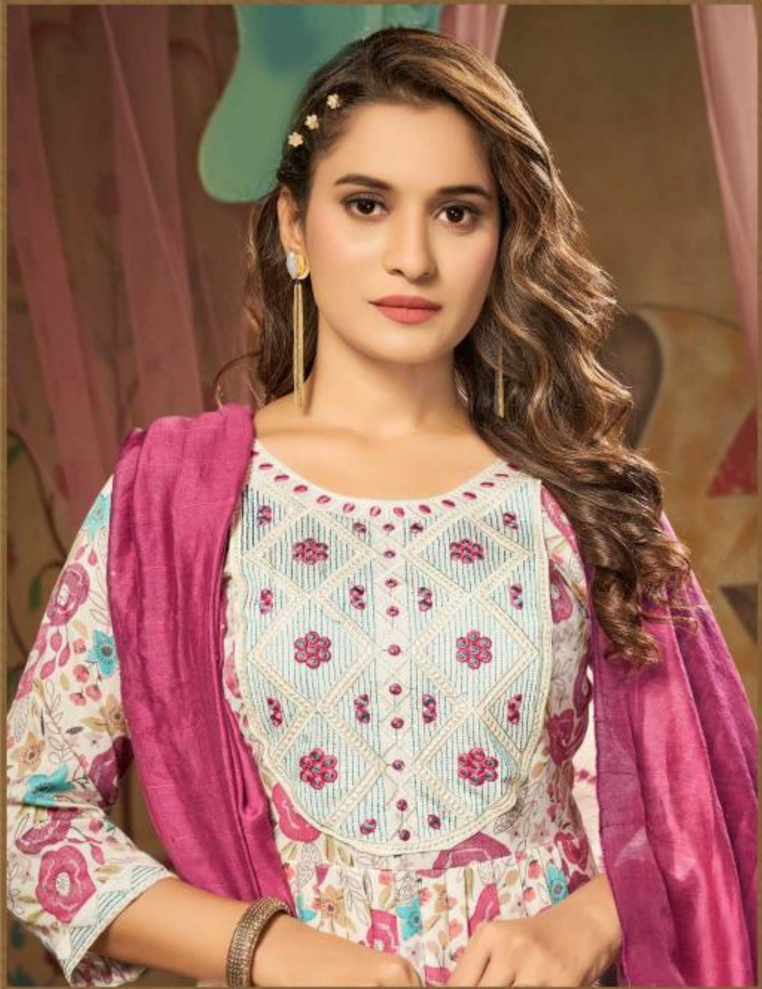
each dress give different look to electric power design we list the top trends for the season