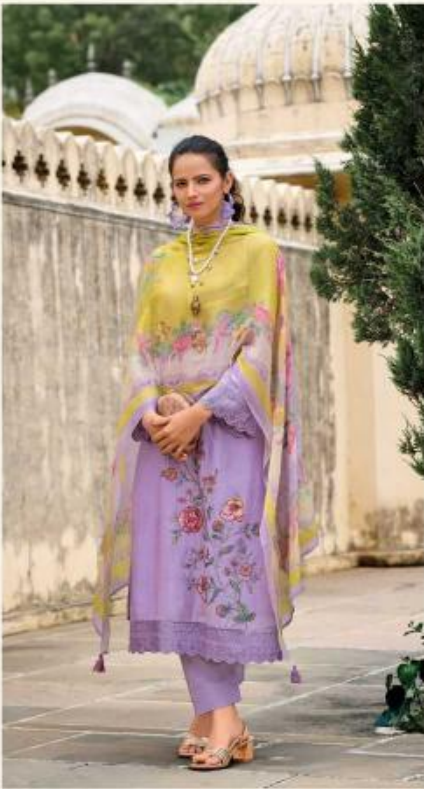
BEAUTY BLUSHING These are the natural beauty full look