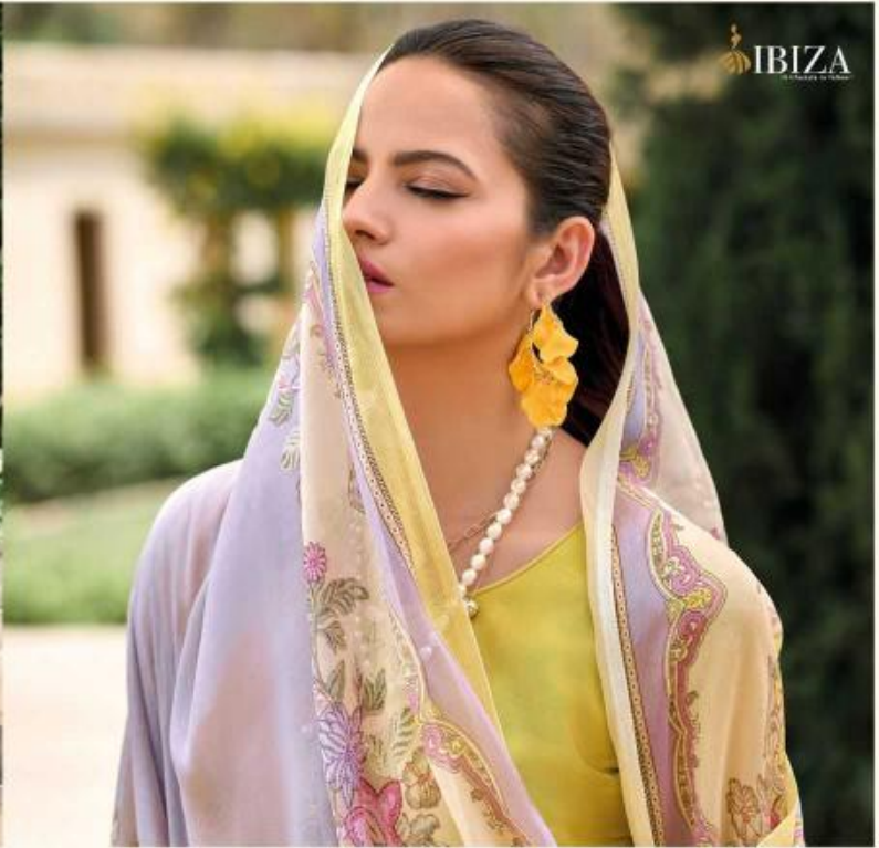
BEAUTY BLUSHING These are the natural beauty full look