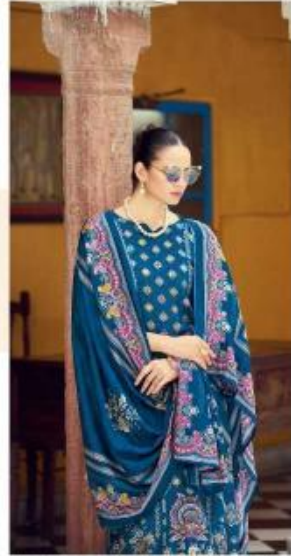
A BREATH TAKING ASSEMBLY OF FINE DETAILING & INTRICATE DESIGN INSPIRED BY ANTIQUARIAN