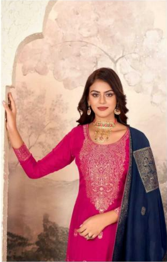
Style is a way to say who you are without having to speak.