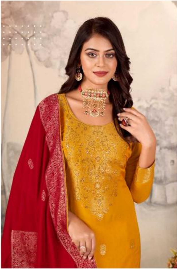
Shik is a way to say who you are without having to speak.