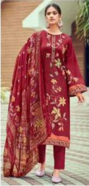
Layla | 15001

ممتاز آرٹس MUMTAZ ARTS® Apparel & Fashion