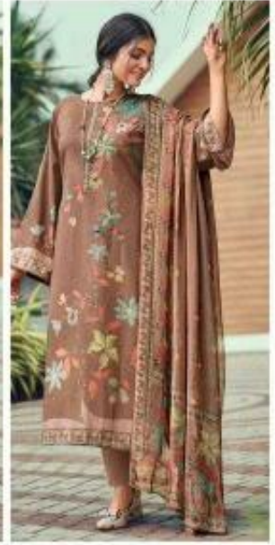
Layla | 15004