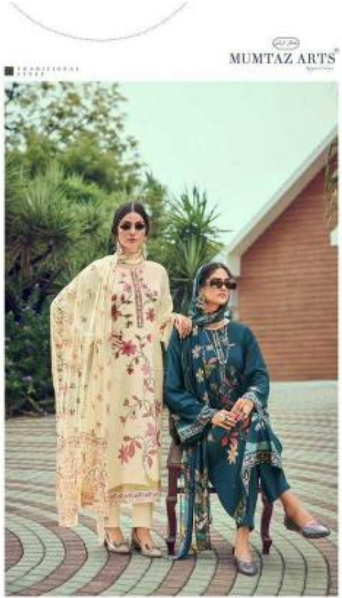
There's something about a dress that makes you feel like you're in a story. It's not just the fabric, it's the way it makes you feel. It's the way it makes you feel like you're in a story. It's the way it makes you feel like you're in a story.