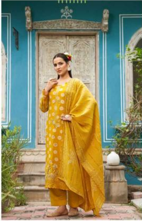
Behave myself, not to impress, but for comfort and for style.