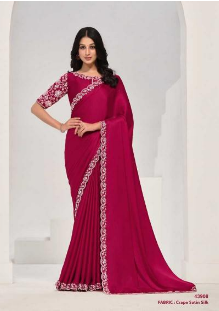
43908 FABRIC : Crepe Satin Silk