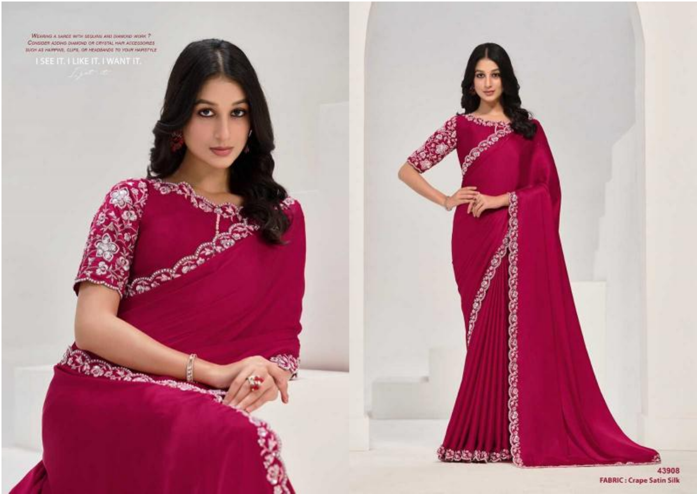
43908 FABRIC : Crepe Satin Silk