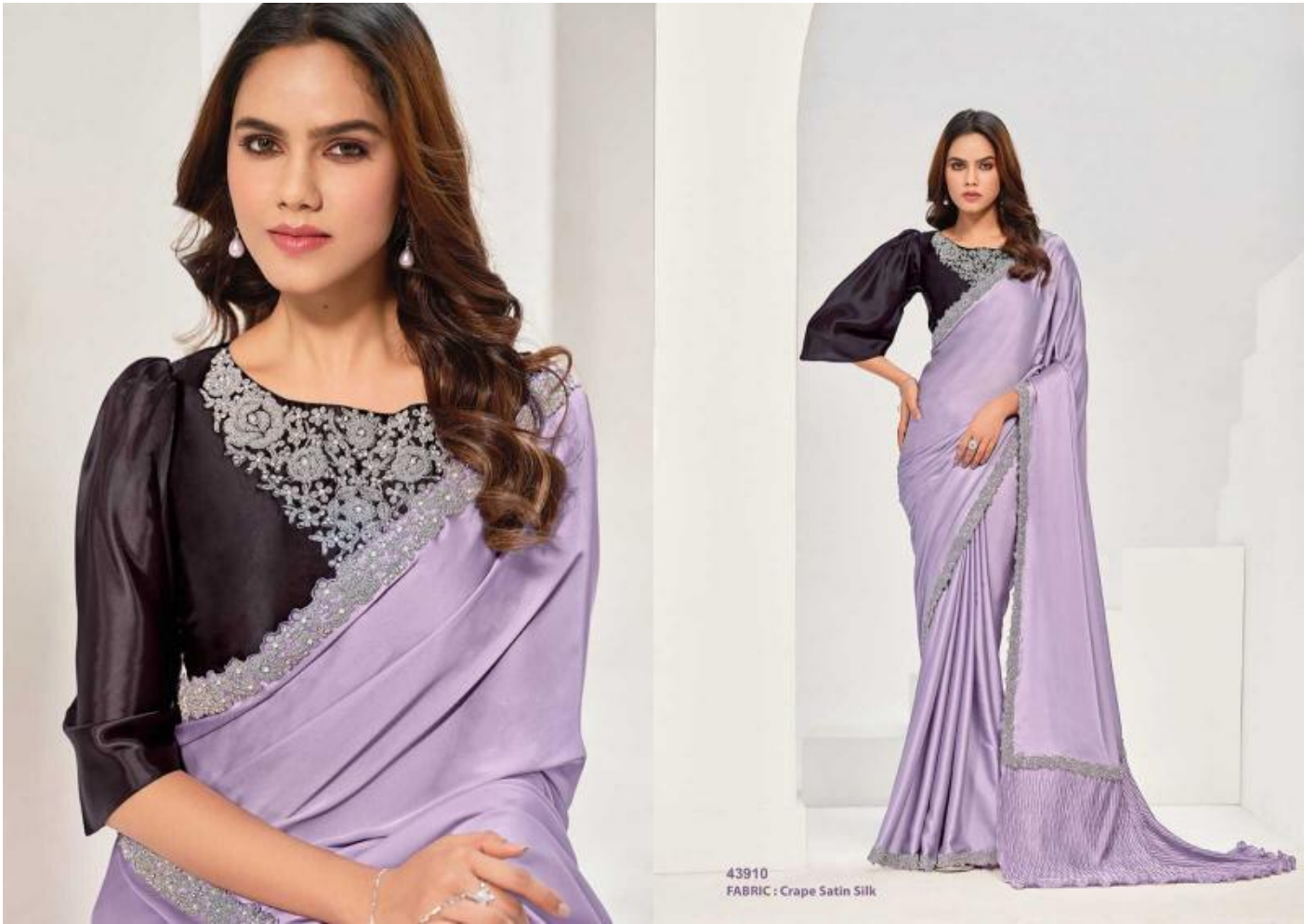
43910 FABRIC : Crape Satin Silk