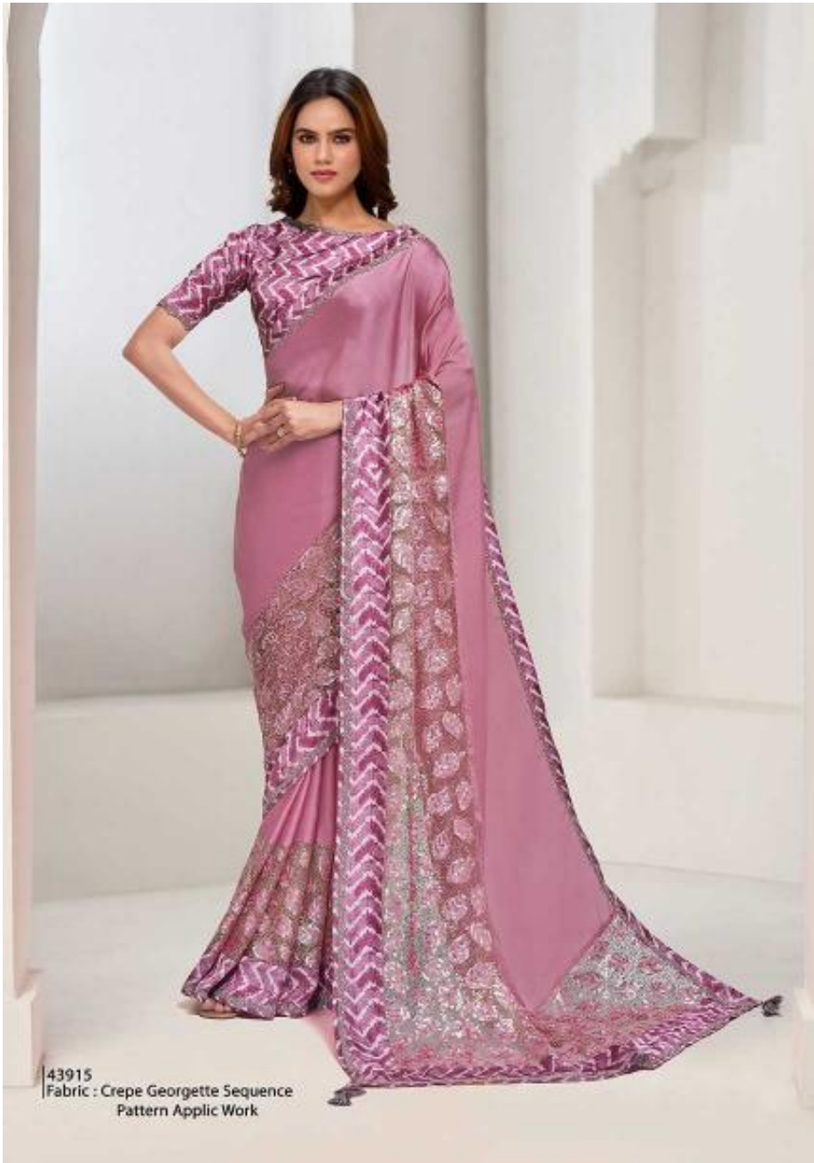
43915 Fabric : Crepe Georgette Sequence Pattern Applique Work