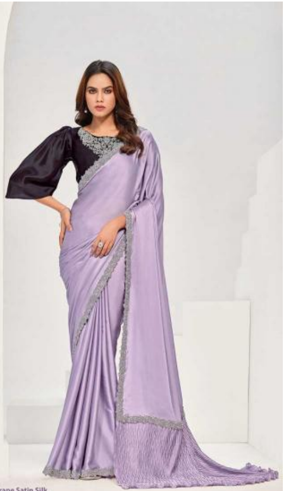
43910 FABRIC : Crape Satin Silk