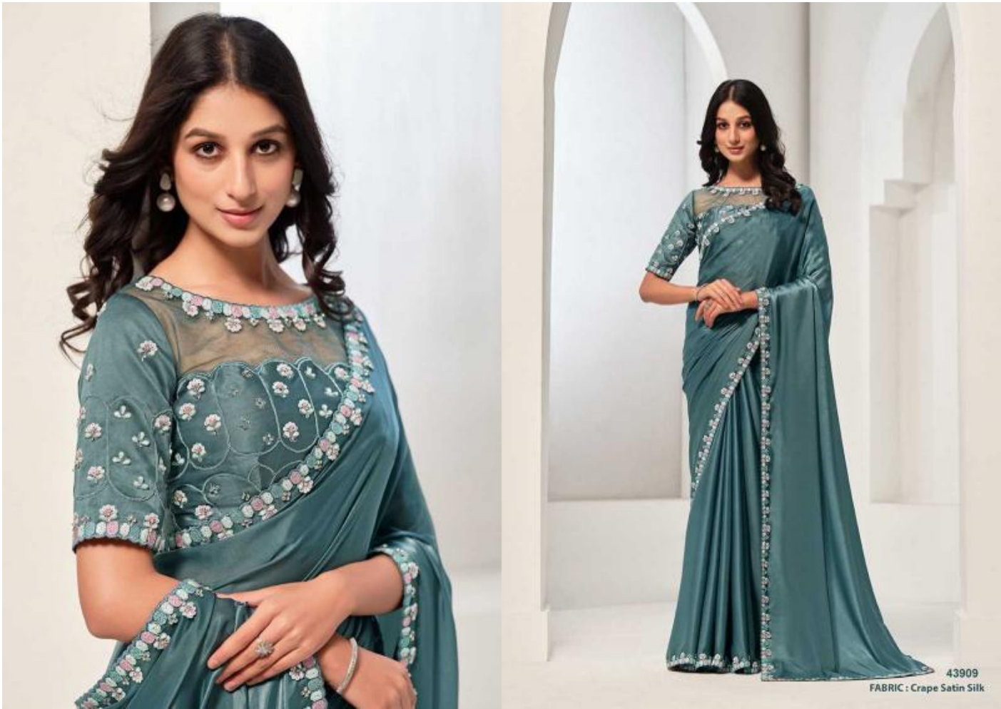
43909 FABRIC : Crape Satin Silk