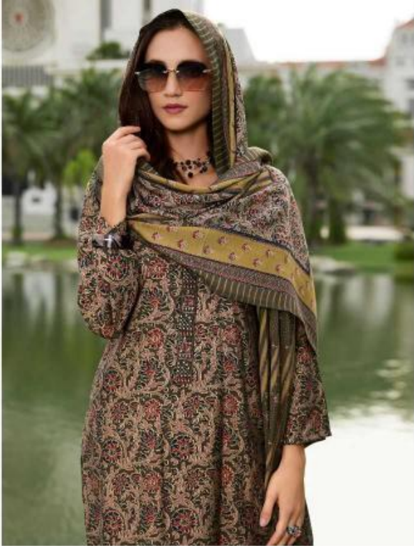
The colours of earth, orange and green, are as soothing as they are harmonious. Add a understated elegance to your day with this dress. D.no.15672