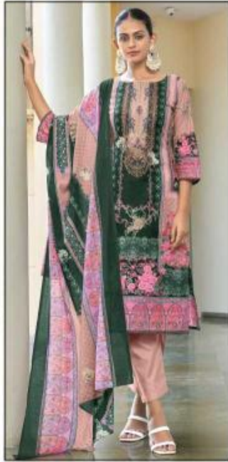
D.NO. 1001 B