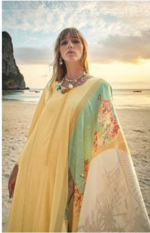
Spinal the public dimension of Papadimitriou, she stands in the air, now always aimed to SEEK ATTIRE IN THE COLOR OF GOD and in the of nature and world. Avery, long after she takes a step, it's important from the landscape for the people, what's truly nature.